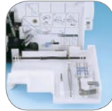
Built-in accessory storage