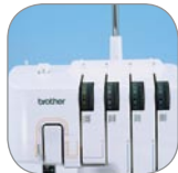
4 colour easy threading guide