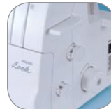
Easy access controls