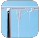
Thread twist protection