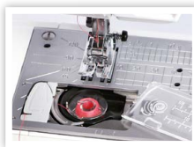
EASY SET BOBBIN

Key Features The M100 QDC features a varied selection of stitches for fashion, quilting and home décor. A portion of proceeds will be donated to the Canadian Quilters' Association and Courtepointe Quebec for their continued support of quilting across Canada.