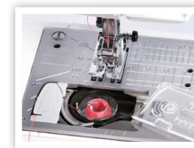
EASY SET BOBBIN

Key Features The M100 QDC features a varied selection of stitches for fashion, quilting and home décor. A portion of proceeds will be donated to the Canadian Quilters' Association and Courtepointe Quebec for their continued support of quilting across Canada.