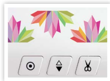
CONVENIENCE: AUTO THREAD CUTTER