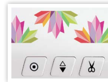
CONVENIENCE: AUTO THREAD CUTTER