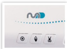
CONVENIENCE: AUTO THREAD CUTTER