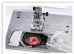
EASY SET BOBBIN

Key Features The M100 QDC features a varied selection of stitches for fashion, quilting and home décor. Auto thread trim, abundant accessories and a lightweight, yet solid metal frame make this a great all around machine for class and travel.