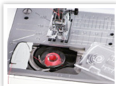
EASY SET BOBBIN