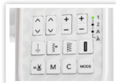
DIRECT STITCH SELECTION, MEMORY AND THREAD TRIM

Key Features The M200 offers a deluxe QDC package of features including a wide selection of quilting and applique stitches, a programmable block alphabet (perfect for personalizing projects and quilt labels) and auto thread trim.