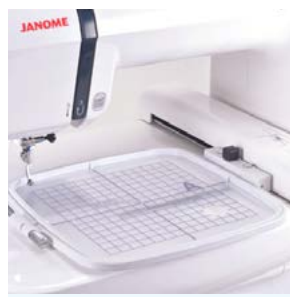
MAXIMUM EMBROIDERY SIZE: 5.5 X 5.5"