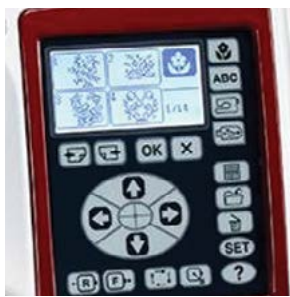
73 DESIGNS AND 3 MONOGRAMMING FONTS