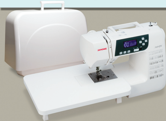
3160QDC shown with included Hard Cover and extension table. (Optional on 2160DC)