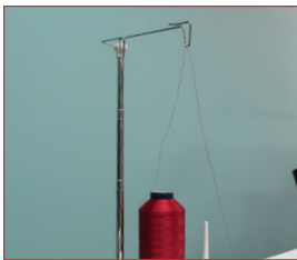
Built-in Telescoping Thread Stand