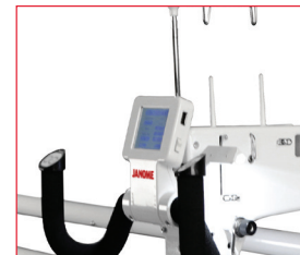
Adjustable Front and Rear Handlebars