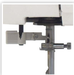
BUILT-IN ONE-HAND NEEDLE THREADER