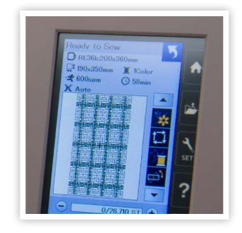
FULL COLOR LCD TOUCHSCREEN