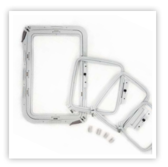
4 STANDARD HOOPS INCLUDED