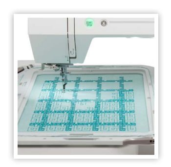
MAXIMUM EMBROIDERY SIZE: 7.9 X 14.2"